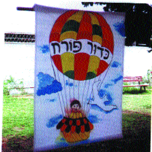
The above banner was displayed at a joint learning festival for students with and without special needs.

This emphasis on integration is in stark contrast to the tautology described in the Definitions section of the law. Critics claim that these diametrically opposing parts of the same law create legal and administrative ambiguity, enabling the Ministry of Education (MOE) to interpret as it sees fit.